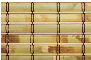
No.95r Basin Bamboo Rustic w/Reed

Order no-charge memos online at hartmannforbes.com or contact your local representative showroom.