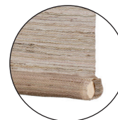
Tailored-to-Size Tacked round hem

Woven-to-Size Hand-sewn tapered oval hem