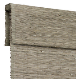
Front Valance Upgrade