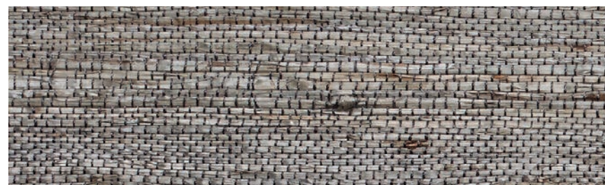
LE1360 Glimmer - Zanella

NATURAL WINDOWCOVERING | Grassweave [WTS]