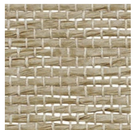
PE600-30 Wise Sage