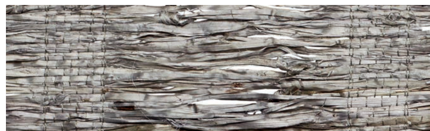
LE1860 Heritage - Armure