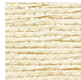
PE600-06 Sacred Desert