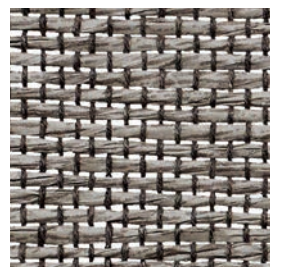
PE600-60 Steady Graphite

NATURAL WINDOWCOVERING | Papyrusweave [WTS]