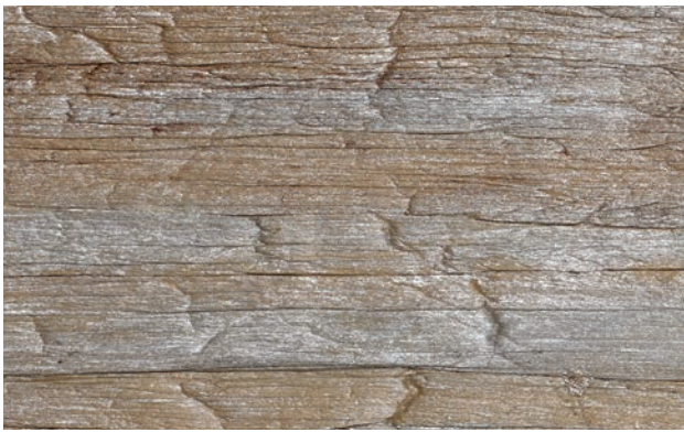
WL414-12 Seaboard – Landing

Random patterns of seaside tones and textures can be seen in this unique design crafted by hand-stripping, flattening and applying a wash of natural metallic pigments to water lily fibers.