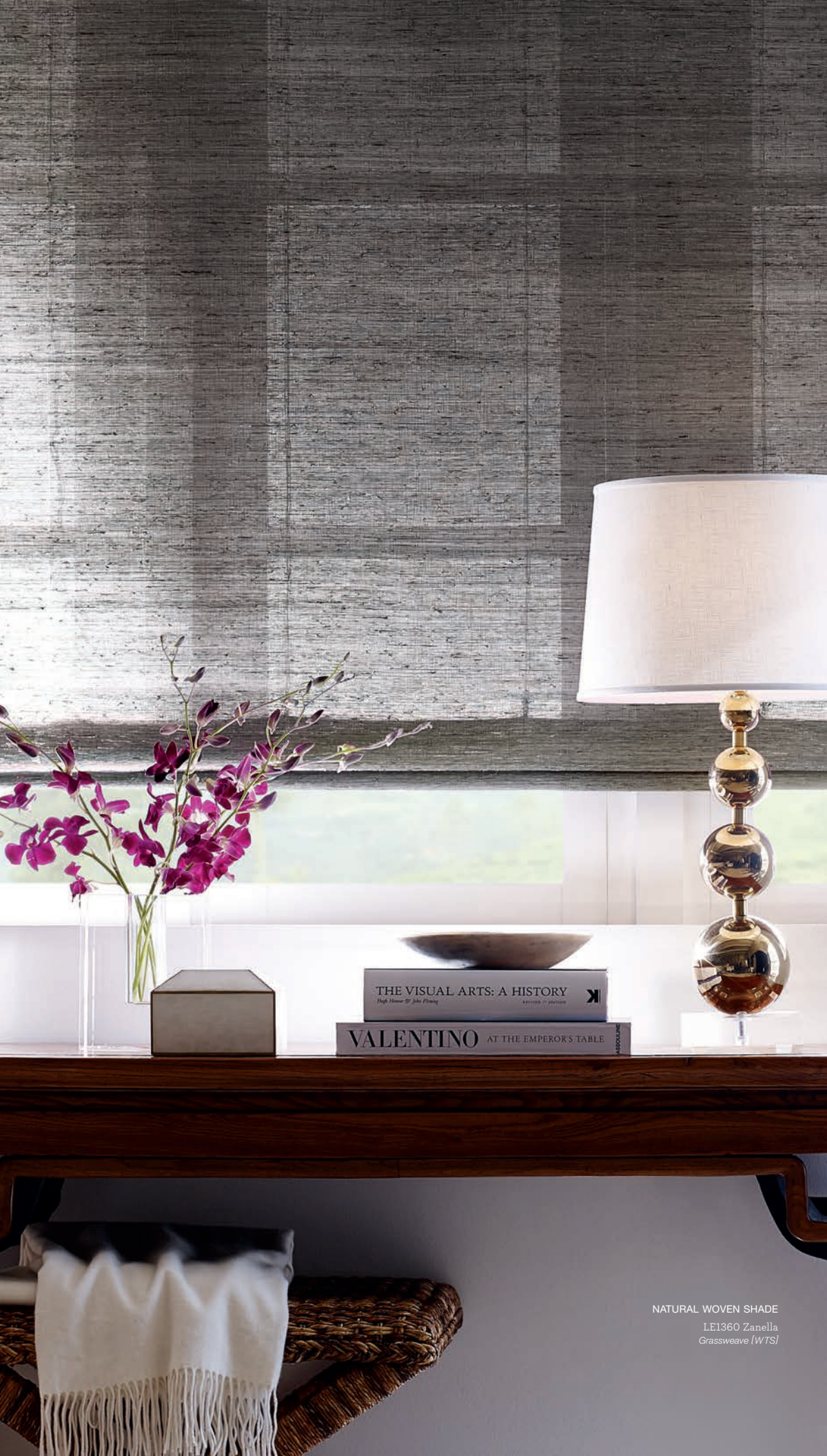
NATURAL WOVEN SHADE LE1360 Zanella Grassweave [WTS]