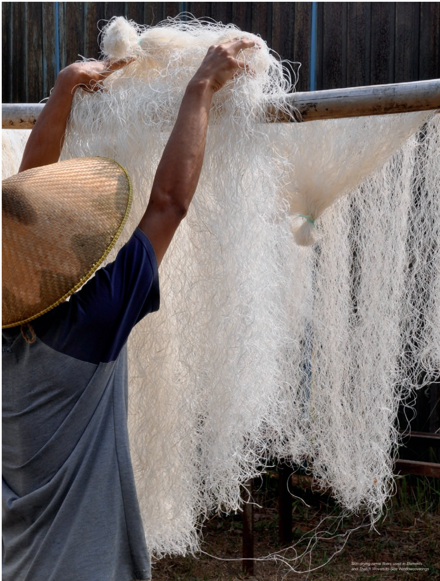
Sun-drying ramie fibers used in Elements and Thatch Woven-to-Size Windowcoverings