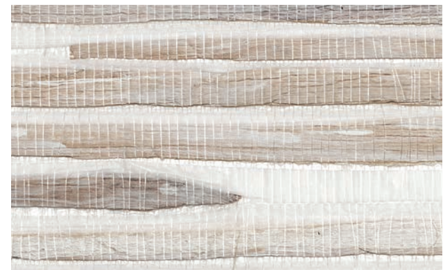
WL414-03 Seaboard – Cape

A glimpse of white shells rising from wave-washed sand is captured in Cape's exquisite design. Hand-stripped fibers of water lilies handwoven with luminous warp threads provide a subtle, elegant shimmer.