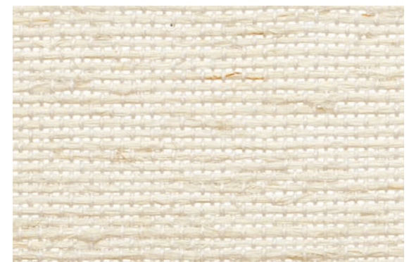
LE1703 Thatch – Wrafton

NATURAL WINDOWCOVERING | Grassweave [WTS]